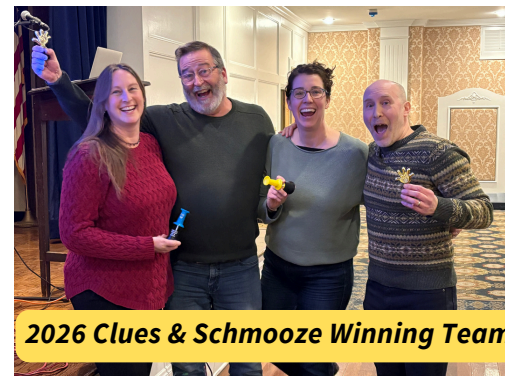
2026 Clues & Schmooze Winning Team

27 SHEVAT 5786 | THIS WEEK'S PARASHAH IS MISHPATIM.