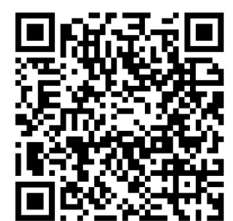
Pittsburgh Magazine Article