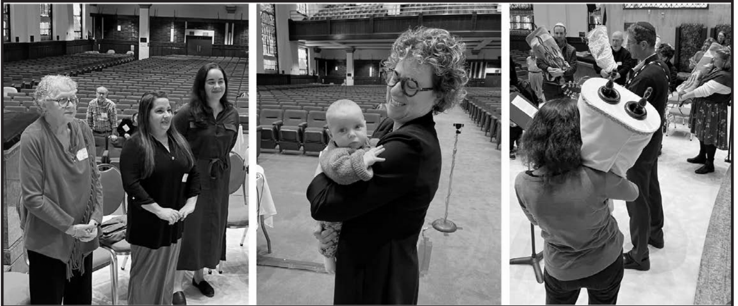
*As of January 2025

We look forward to being part of your memories!