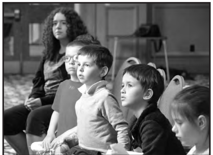
J-JEP students during Pesah