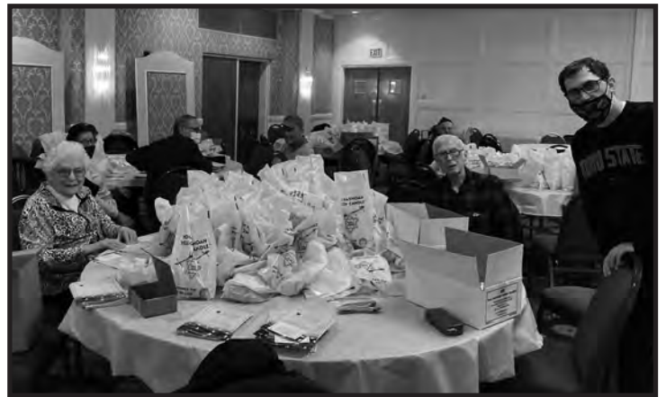
Photo taken during Yellow Candle packing