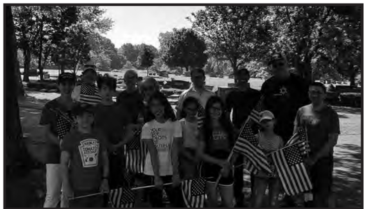
Flag Planting event at the Beth Shalom Cemetery