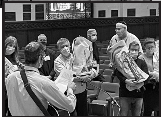
Pictures taken during the New Member Ceremony held on Sunday, November 7, 2021.