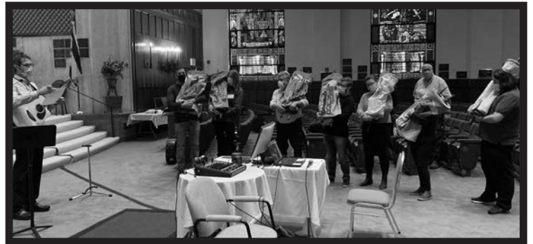
New Members Welcome Ceremony held in-person and online.