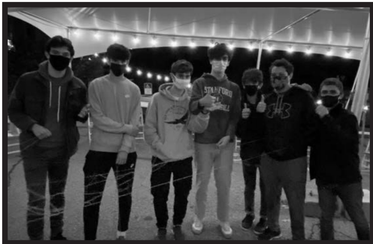
Pittsburgh teens gathered for the Annual Pittsburgh Teen Memorial Havdalah. Teen coordinators used the blue string activity to get the group to open up and start talking about themselves while learning how much they have in common.

BSUSY and Kadima partnered with Young Judea for a fabulous program—in the gym!! They also attended a socially distanced Sukkah Hop. Happily, in-person lounge nights are back and still the same incredible evening — lounge nights provide great opportunities for teens to spend time together and brainstorm new programs. The BSUSY teens help create a moving program as we hosted the four annual Pittsburgh Teen Community Memorial Havdalah. This poignant evening was an example of hard work and community partnership. After, a two-year hiatus, we sent a bus load of teens to CRUSY's Fall Kinnus at Camp Wise in Ohio!