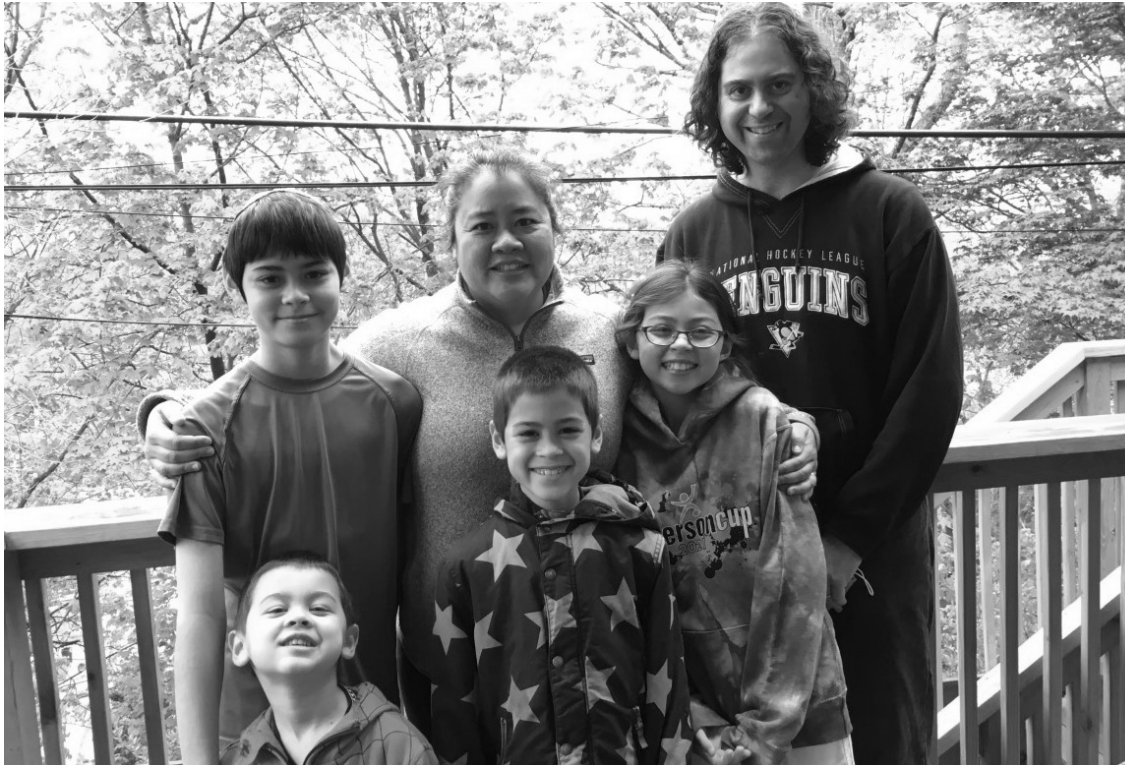
Rare photo showing all six members of the Smuckler Family.

Name in English and in Hebrew (phonetic).