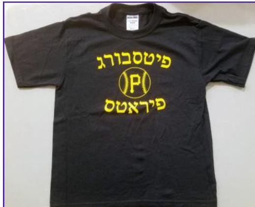
*Not official Pittsburgh Pirates gear.

To order your shirts, go to https://tinyurl.com/CBSShirtSale